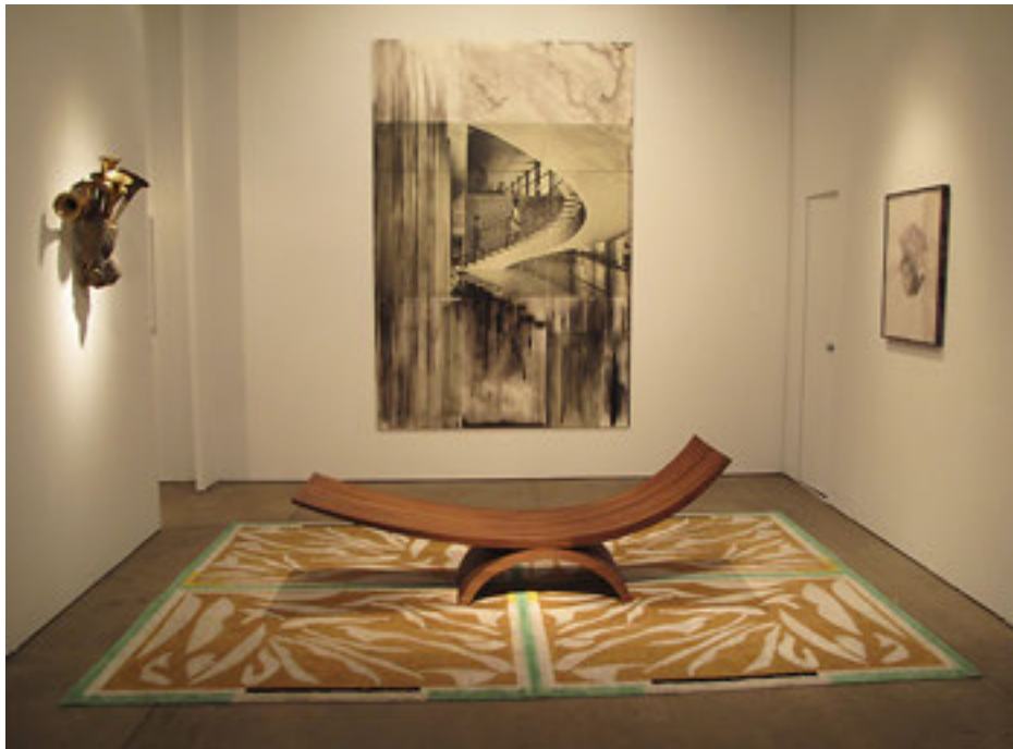
Terry Riley, Lorna Simpson, Betty Woodman and David Adjaye at Salon 94