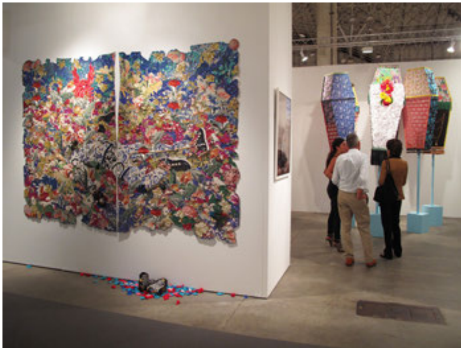
Ebony G. Patterson at moniquemeloche