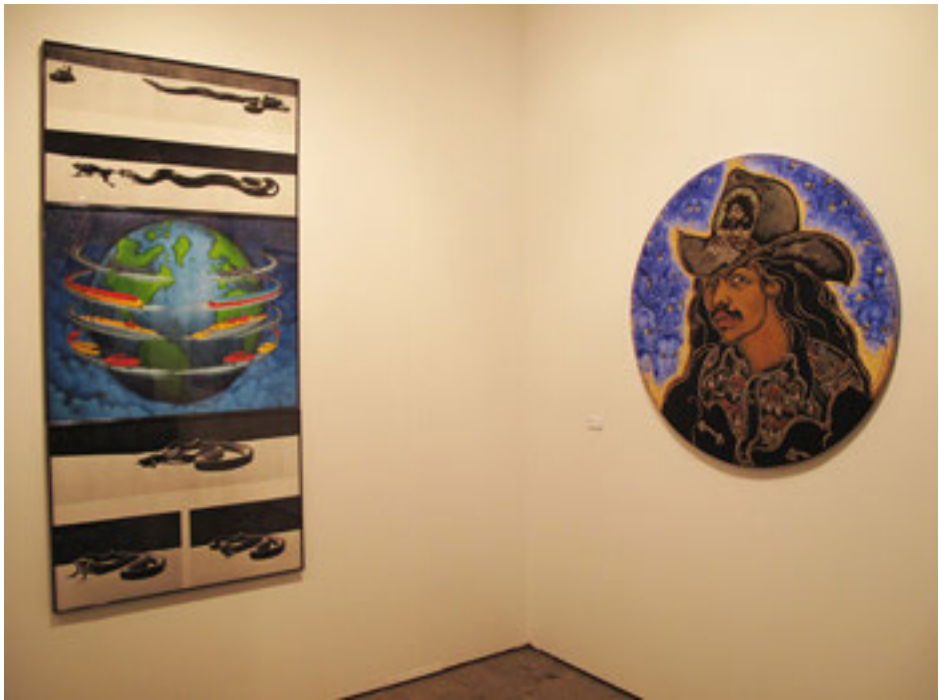
David Wojnarowicz and Martin Wong at P.P.O.W