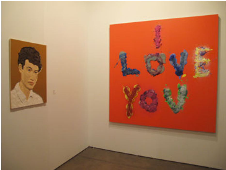
Stephan Balkenhol and Bjarne Melgaard at Galerie Forsblom