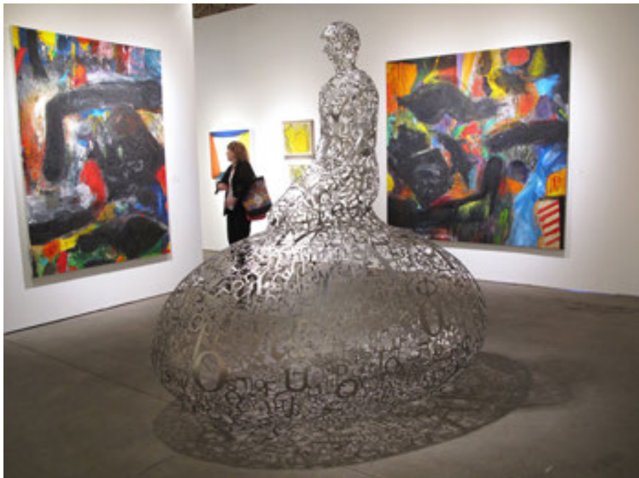
Jaume Plensa and Jim Dine at Richard Gray Gallery