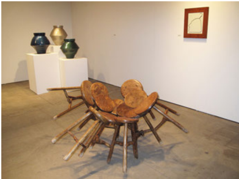
Ai Weiwei at Chambers Fine Art