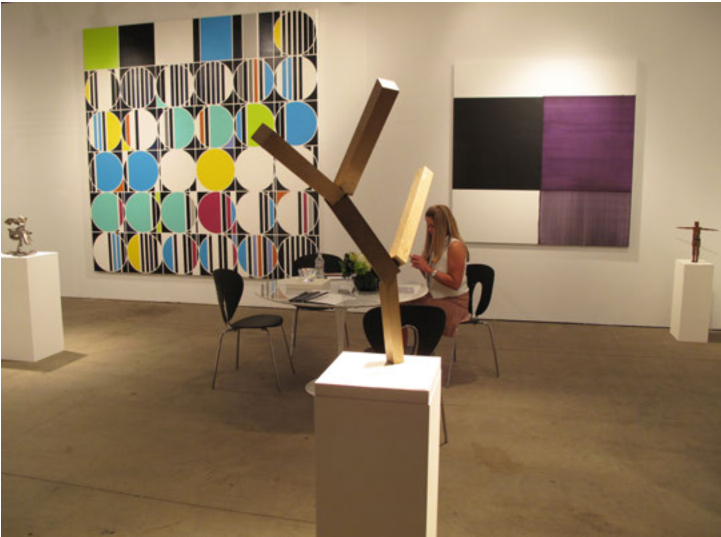
Sarah Morris and Joel Shapiro at John Berggruen Gallery